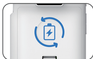
Extended battery life.