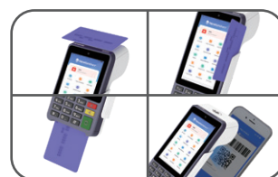
Accept all payment types.