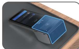
Large NFC zone for intuitive contactless payments.