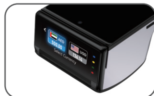
Interactive customer touchscreen, providing more details and interaction.