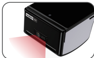
Optional professional scanner for fast payments and efficient inventory management.